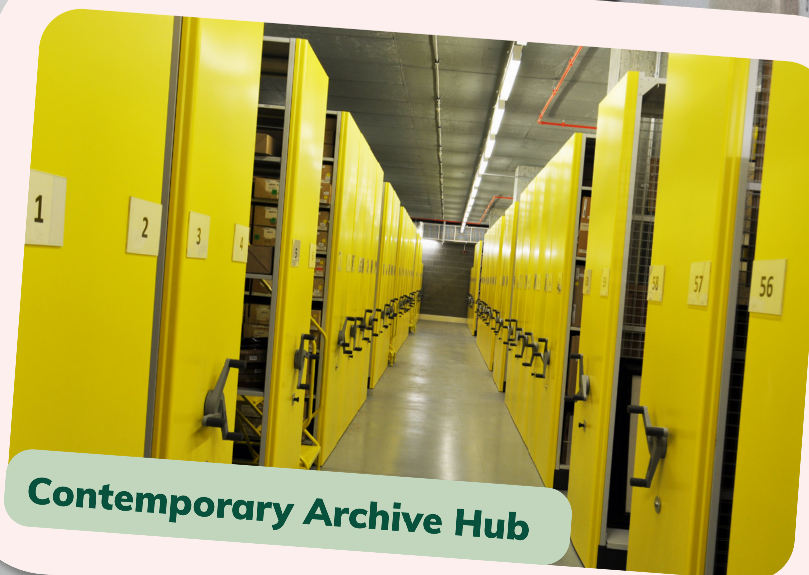
Contemporary Archive Hub